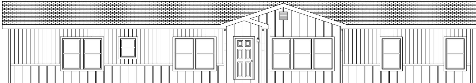
SUN RANCH EXTERIOR