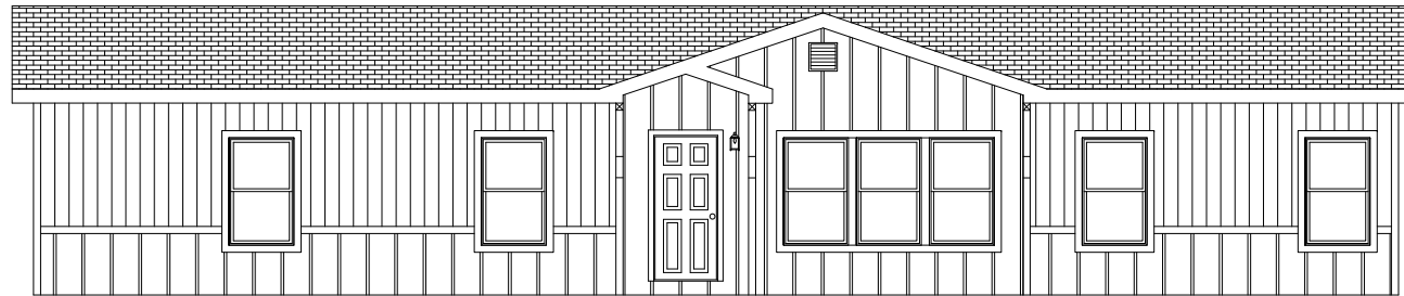
SUN RANCH EXTERIOR