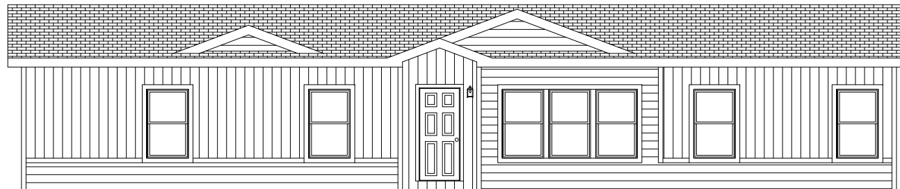
OPTIONAL RIDGELINE EXTERIOR

Because Palm Harbor Homes has a continuous product updating and improvement process, specifications are subject to change without notice or obligation. Likewise, the floor plan shown is representative only and may vary from the actual home. Square footage calculations are based on nominal widths and all room dimensions are approximate subject to industry standards. R-values may vary in compressed areas. Some transportation components may have been recycled after close inspection for safety and appearance.