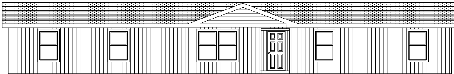
STANDARD FIESTA EXTERIOR