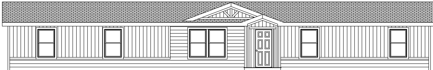
OPTIONAL ESTATE EXTERIOR

The "GREYSTONE" Model: 320FT28764C Austin, Texas Date: 01/05/2015