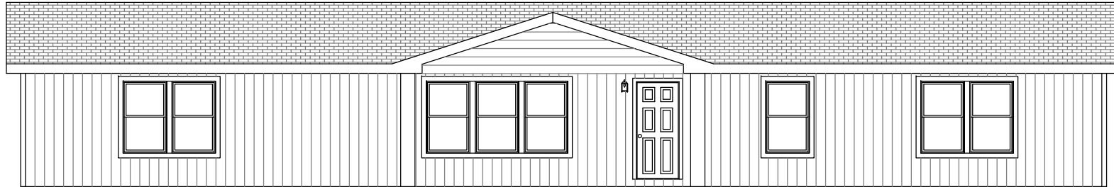
STANDARD FIESTA EXTERIOR