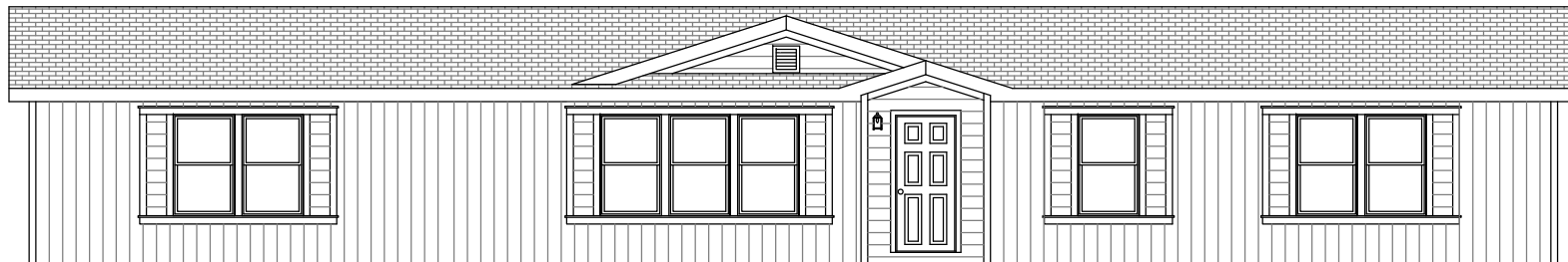
OPTIONAL HOMESTEAD EXTERIOR

Because Palm Harbor Homes has a continuous product updating and improvement process, specifications are subject to change without notice or obligation. Likewise, the floor plan shown is representative only and may vary from the actual home. Square footage calculations are based on nominal widths and all room dimensions are approximate subject to industry standards. R-values may vary in compressed areas. Some transportation components may have been recycled after close inspection for safety and appearance.