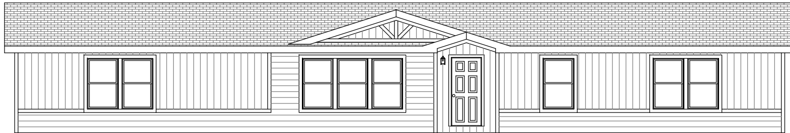
OPTIONAL ESTATE EXTERIOR