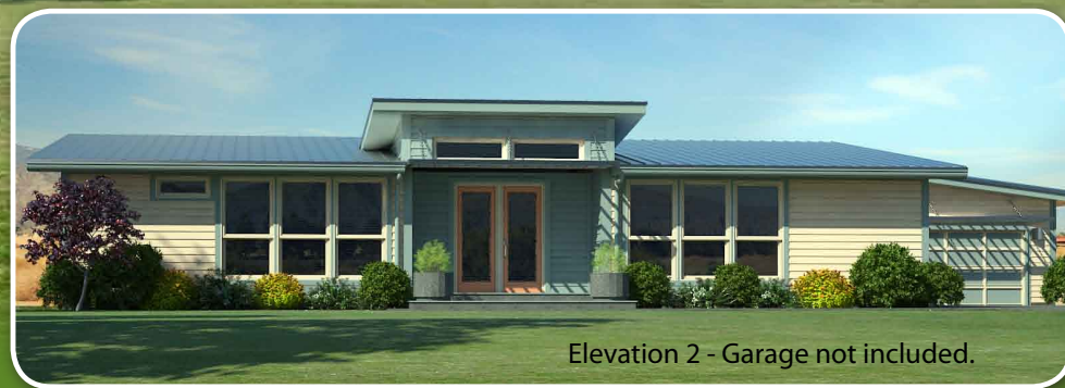
Elevation 2 - Garage not included.

Modular Elevation Shown Above . Rock work shown here is a field-installed option. Garage not included.