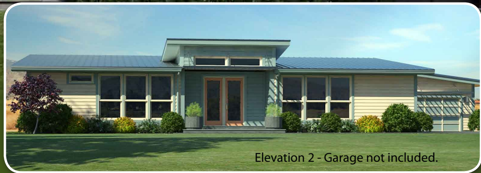
Elevation 2 - Garage not included.

Rock work shown here is a field-installed option. Garage not included.